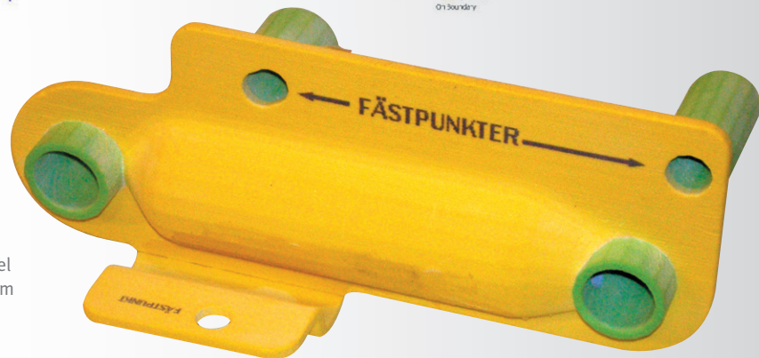
3D Model of Diesel Engine Fuel System Component

Anyone who’s stepped into the ocean has felt the fearsome power of water. A wave pushing you back to shore or an undertow dragging you out to sea hints at the principles behind hydroforming, a metal-shaping technique that yields stronger, lighter and potentially more intricate products.