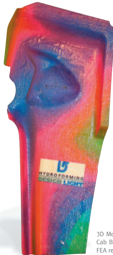
3D Model of Truck Cab B Pillar with FEA results